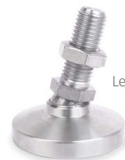
Stainless Steel Leveling Mount with Swivel Stud

*Davis Colors is a trademark of Rockwood Pigments