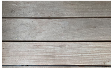
NATURALLY WEATHERED IPE