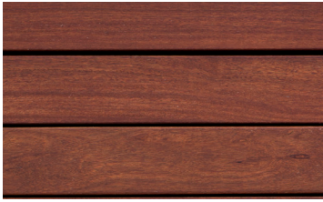
NEW PRODUCT IPE FINISH