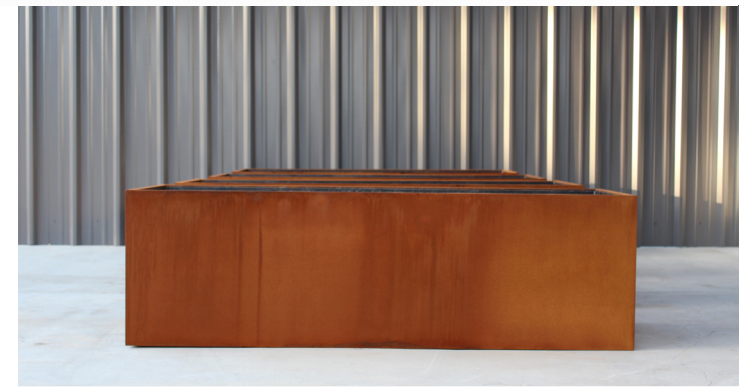
Example: Typical Pre-Weathered Finish